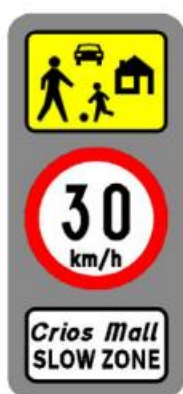
Sign F 403: 30 km/h Slow Zone

There are six aspects to be considered when positioning a sign: